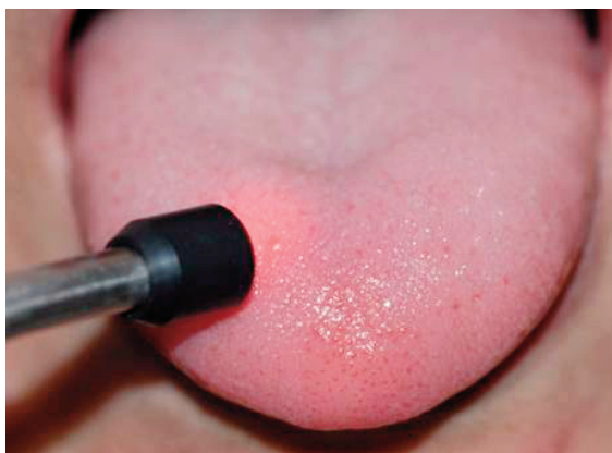
Figure 2 - Low level laser irradiation of tongue.

in the aetiology of nBMS is long lasting, since Fox first observations in 1931 (28). Many studies related the lack of function of taste in predisposed subjects, the so-called supertasters, with the burnings typical of the syndrome (29, 30). The reliability of this hypothesis was showed as a first by histological study by Suarez and coll. (21) that showed in tongue biopsies a relevant lower density of epithelial nerve fibres in BMS patients versus controls. Similarly Lauria and coll. (31) demonstrated that BMS patients tongue, compared to normal ones, shows a reduction of trigeminal small fibres.